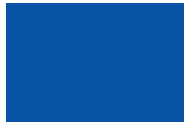
RAL 5017 - Blue

Whilst every care is taken to match the colours shown, variations may occur due to limitations of the printing process, texture and gloss levels on the substrate and the effect of light and shade on location. For best results apply a small sample on location and always ensure batch numbers are the same on all cans used.