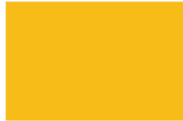
RAL 1003 - Yellow