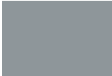
RAL 7042 - Dark Grey