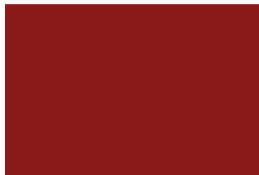
RAL 3011 - Red