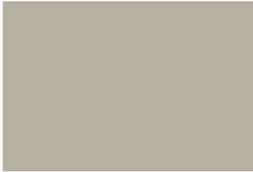
RAL 7032 - Light Grey

The Disbon systems come in a standard colour range as described on this page. Should you have a specific colour you require, it can be manufactured with the following considerations in mind.